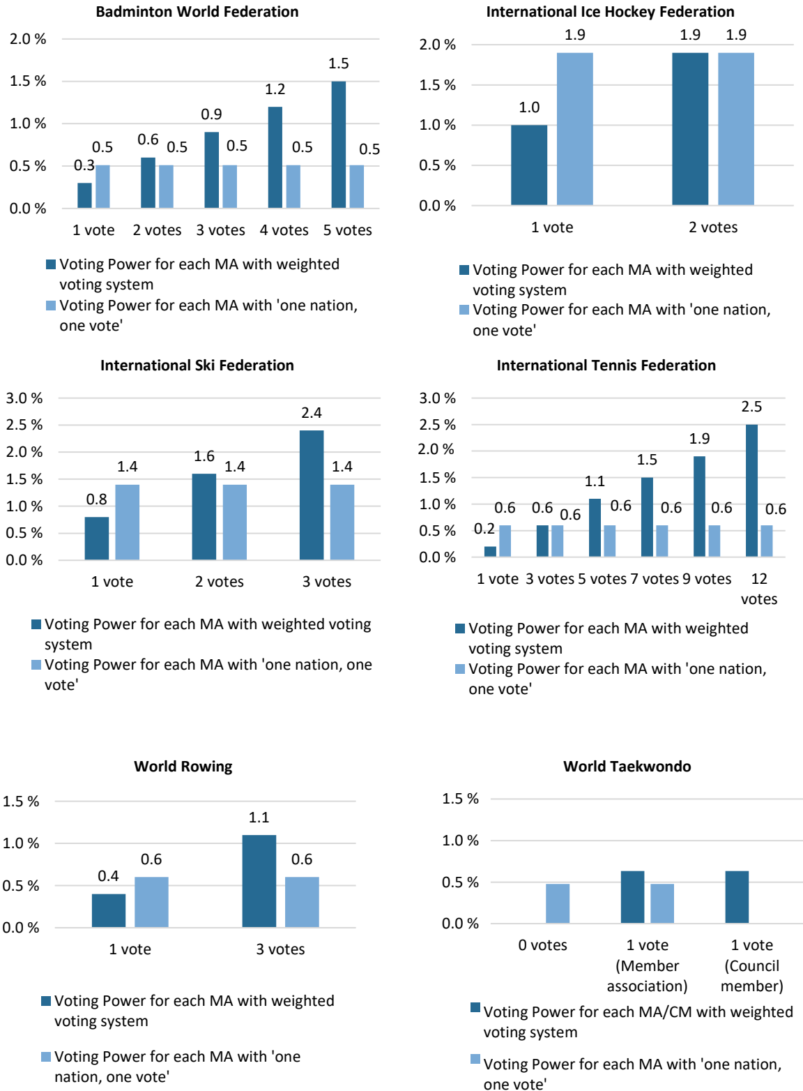
Figure 2: Individual voting power for member associations in a weighted voting system compared to 'one nation, one vote'

systems at International Tennis Federation and Badminton World Federation have a high effect on voting power.